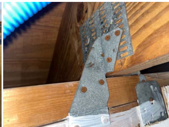
Clip RTW Connection