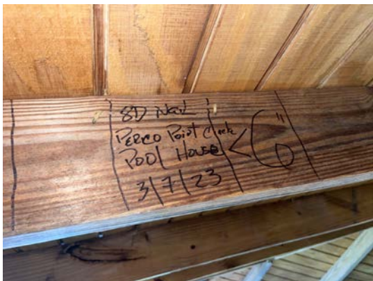
8D Nails Observed