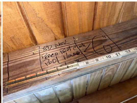
< 6" Nail Spacing