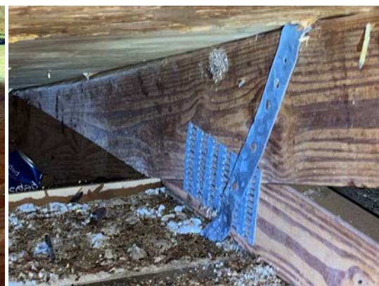
Single Wrap RTW Connection