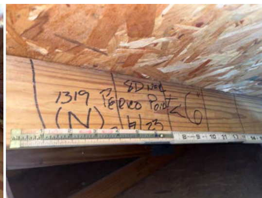
< 6" Nail Spacing