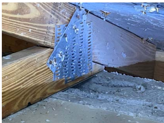
Single Wrap RTW Connection