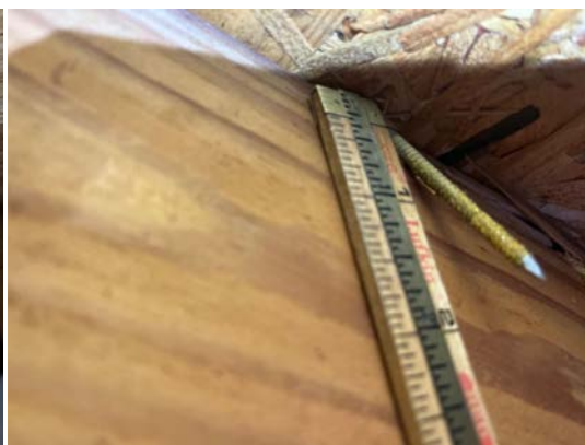
8D Nails Observed