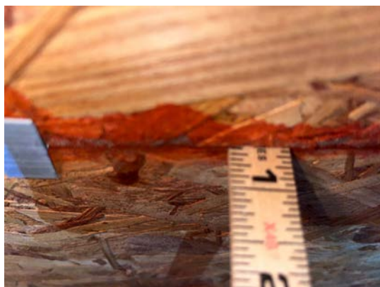
15/32" Roof Decking