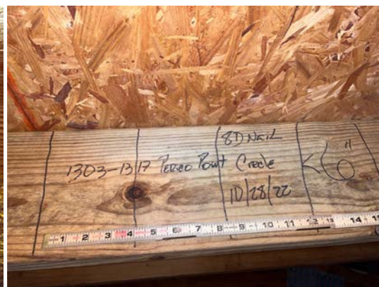
6D Nails Observed