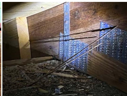
Clip RTW Connection