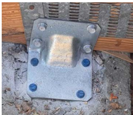
Clip RTW Connection