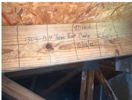
8D Nails Observed