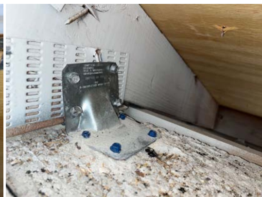
Clip RTW Connection