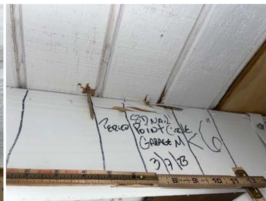
< 6" Nail Spacing