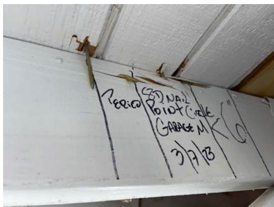
8D Nails Observed