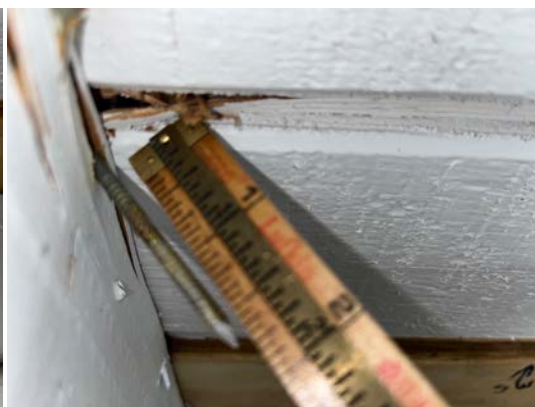
8D Nails Observed